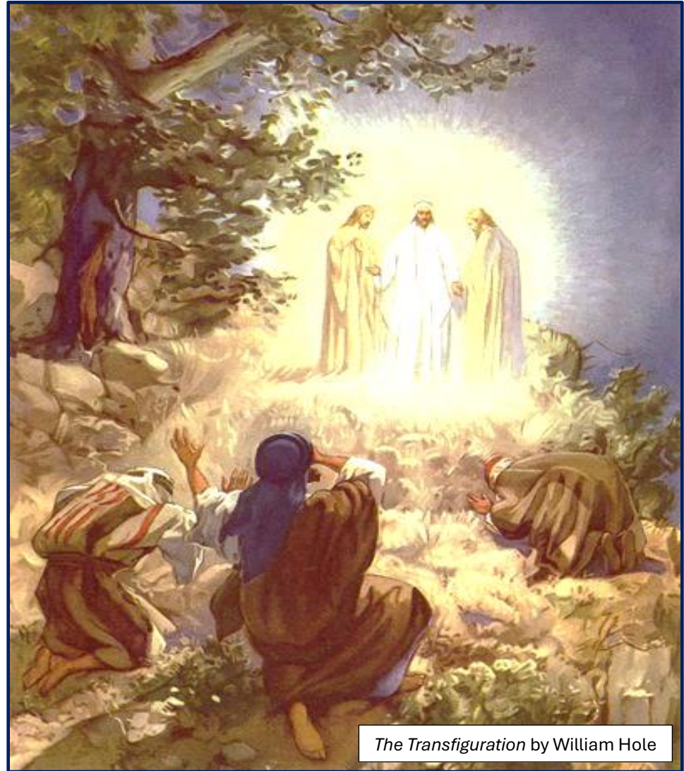
The Transfiguration by William Hole